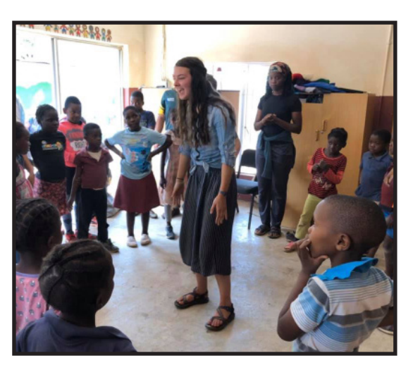
The team and kids sing and dance together