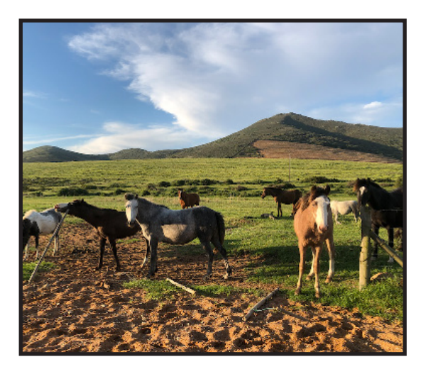
The team sees the beauty of God's creation

The outreach in Darling, South Africa is a reflection of the beauty of God's creation. In Darling, there are rolling hills, flat farmlands, mountains in the distance, and many different reminders that God makes the most beautiful things out of nothing. During the month in Darling, the team experienced life on a farm by living in a local church and making relationships with the families and kids on the farm. The team also participated in farm outreaches in different schools where they can share the Hope of Jesus. In the afternoons, the team participated in the Good News Club and had more opportunities to share about Hope and pray for the children.