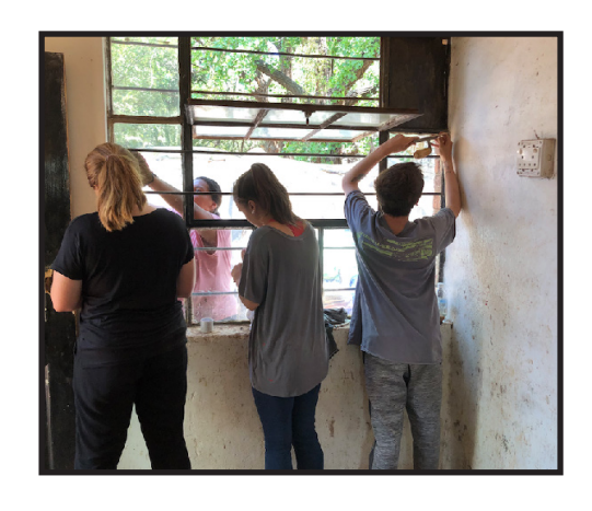
Mooiplaas, Gauteng, South Africa: The team helps clean windows for the new library. Previously the windows had been covered in dirt and paint.