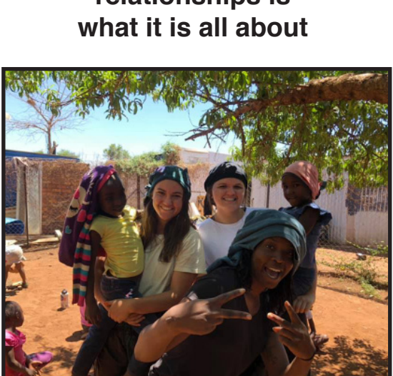
Being joyful is a character of the Kingdom