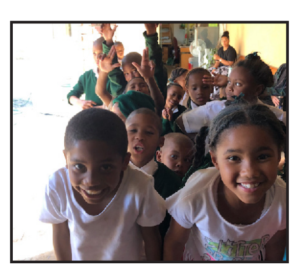
All smiles when it comes to lunch time