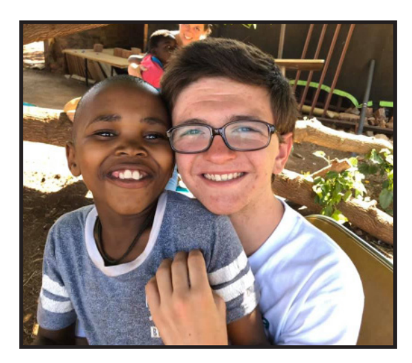
Building relationships is what it is all about

Our team finished out their time in South Africa in Mooiplaas. The teams got to experience the true brokenness of Africa but more so the huge blessing that the people of Africa have. The team walked alongside teachers at a local school and the staff at the ministry. The team taught in classrooms, helped with yard work, and also built on the relationships that have already been established in Mooiplaas. It was an amazing month of seeing God work.