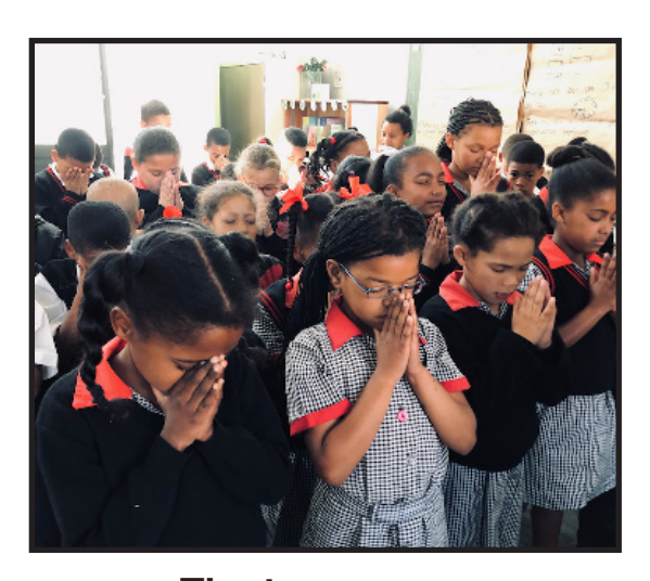
The team prays with different classes of kids in schools